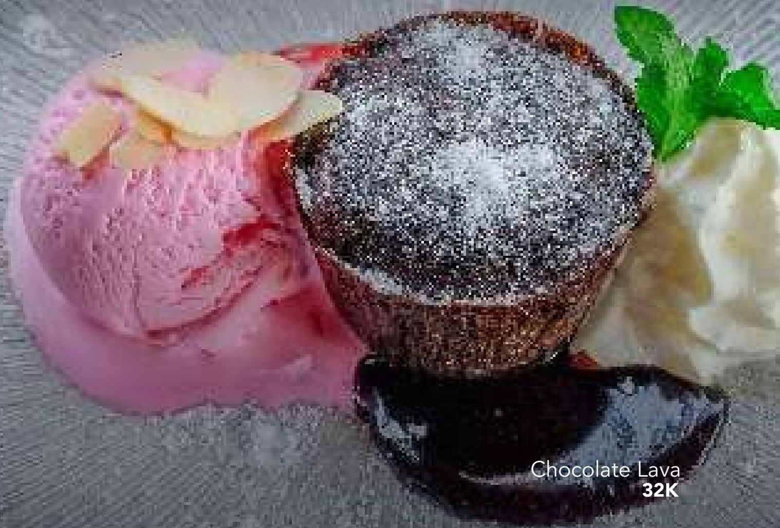
Chocolate Lava 32K