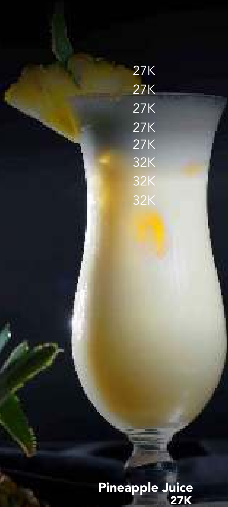
Pineapple Juice 27K